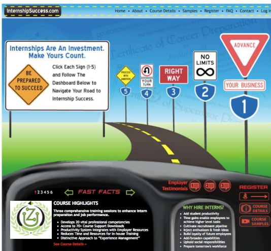
Figure 3: Employer Resource Center

This intern training course is part of a complete system of solutions from Z University for employers to develop high-quality programs through methodical management of the internship experience.