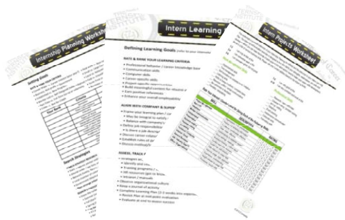
Figure 2: Experience Enrichment Tools

Course-takers can utilize more than 70+ support tools in conjunction with the training sessions, such as worksheets and other resources to: